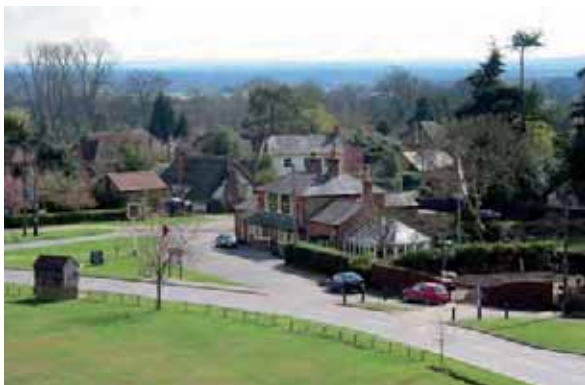
▲ Silchester village, featuring The Calleva Arms

The Village Hall was built on land given by a local resident in 1926, and then cost £1,767. It opened with a pantomime on the 21st December 1926. With the later addition of the 'Club Room', paid for by The Working Men's Club, the Hall has been in permanent use for the benefit of the local Community. It is run as a Charitable Trust with a Management Committee to oversee activities.