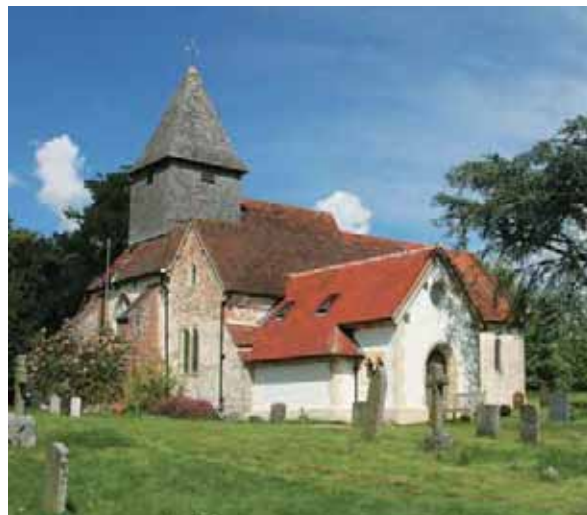
▲ Church of St Mary the Virgin

As you walk round the Roman Town Wall, before you reach the path to the main car park, you will see Rye House to your right. The present house is 17th century, but was built on the site of the hospice or convalescent home for the Monks of Reading Abbey. They would be sent here to recover from illnesses or perhaps to die. It is not known why the Monks chose this site, but material from the Roman Town was used in the building of Reading Abbey, founded by Henry I in 1121.