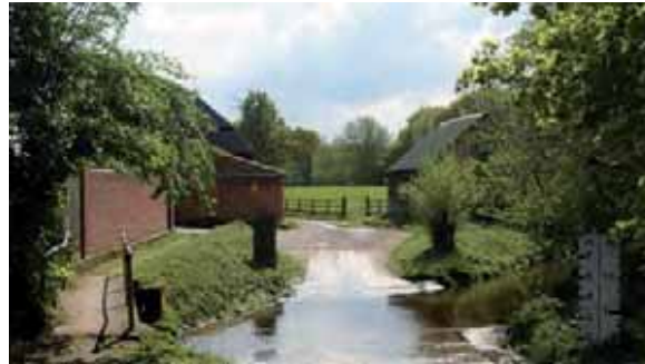
▲ Clappers Farm ford

To your left of the kissing gate is a small 13th century moated site, restored fish ponds and water-meadows. This site is believed to have been the residence of the Keeper or 'Parker', an important manorial official of the Manor of Silchester. Nothing of the building survives, but the fish ponds and water-meadows, now planted with cricket bat willows, have been restored with the help of the Countryside Commission (and are open to the public).