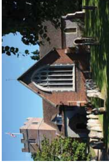
▲ St James' Church