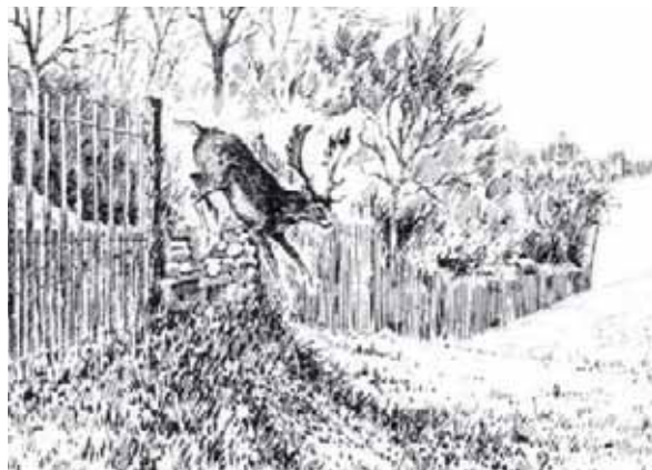
▲ Illustration of a Park Pale

The Trail takes you across the middle of the mediaeval park. In 1204 the Lord of the Manor paid the price of a palfrey (a small saddle horse) for a 'Licence to Impark' from his friend King John. The boundary, or park pale, was a substantial earth bank topped by a wooden paling fence and inside ditch. This contained gates and deer-leaps which enabled the deer to jump into the park, but not out! The original park pale can still be traced for much of its length and you will walk through it on the way to the Church.