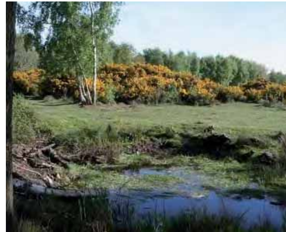
▲ Old gravel workings on the Common

Today's public house was built as 'The Crown' by Rector John Coles in 1837. The Rector installed as Landlord his tenant whose farm had served as the local ale-house. The Calleva Arms is a central feature of the Village now, but in the Norman and mediaeval period, the settlements were grouped around the Church and at The Pound. Increasing population in the 15th century led to clearance on the common and a settlement shift away from the Church.