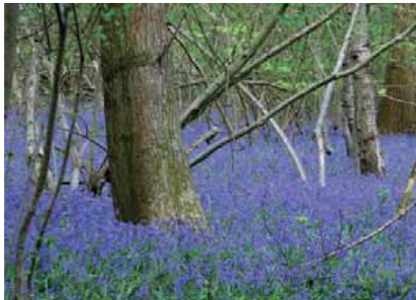
▲ Bluebell wood

From the Frith the Trail returns to Bramley Station by way of local lanes.