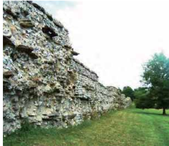
▲ Silchester Roman Wall, from the south gate

From The Pound, the route is waymarked, taking you over Silchester Brook again and across the open fields to Bramley Frith. (Please note that in wet weather the path adjoining Bramley Frith can be very muddy).