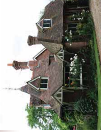
▲ The old Post Office, built 1884, now a private house

Text researched by Rev. RC Toogood