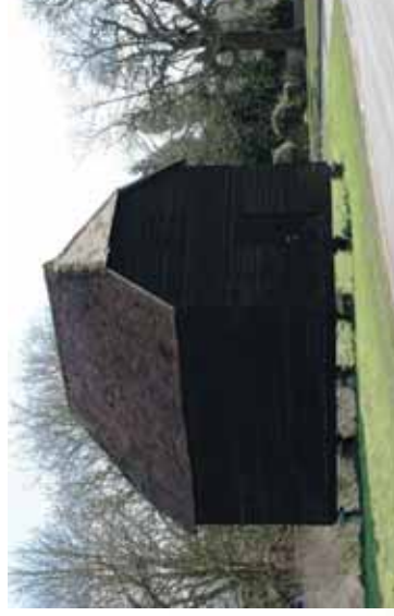
▲ The Granary