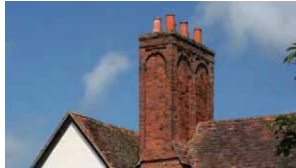
▲ Chimney of Old Manor House

After visiting the Church proceed north up the road to see the remains of the Roman amphitheatre. You will be able to return to the route by passing through the kissing gate beside the road to the rear of Manor Farm House.