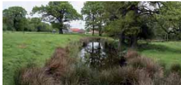
▲ Remains of mediaeval moat